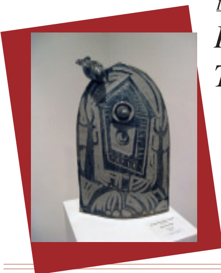
Left: Fiely-Smith, Homecoming , Award for Ceramics, Spring Show , 2010