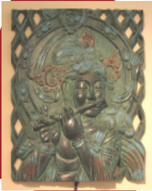
Bronze Lantern Panel (Replica)

For more information on the Sister Cities exhibit at St. Rita's, please call ArtSpace at 419-222-1721. Or visit the website: http://www.artspacelima.com