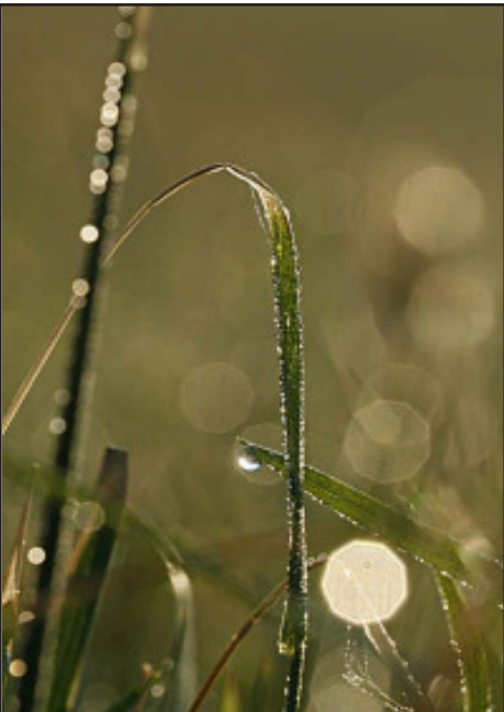
Alice Schneider Grass and Dew Best of Show