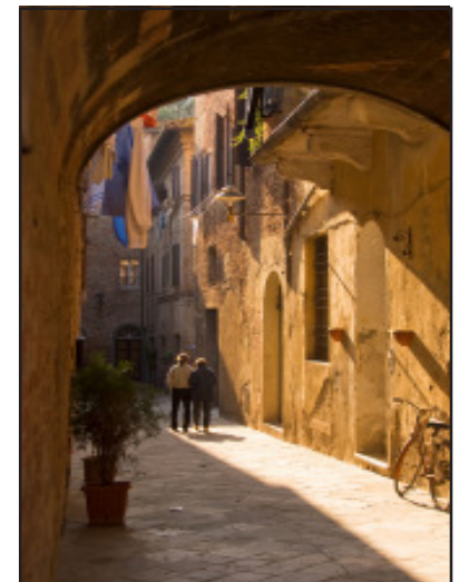
James Lipps Comfortable Moments First Place, Architecture