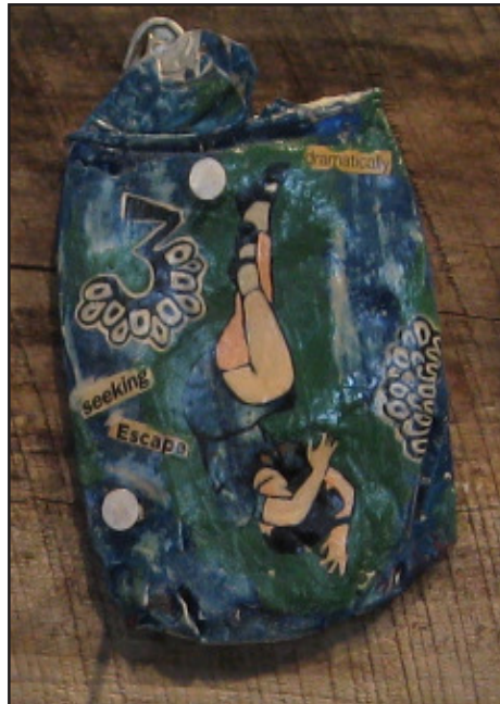
Lydia Schimpf Falling Girls (Detail) Best of Show